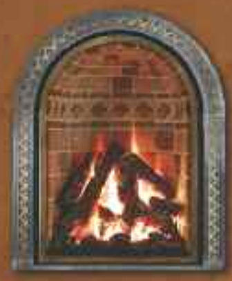
Go online to create your perfect fireplace with distinctive fronts, doors, overlays, linings and andirons in your choice of finishes.